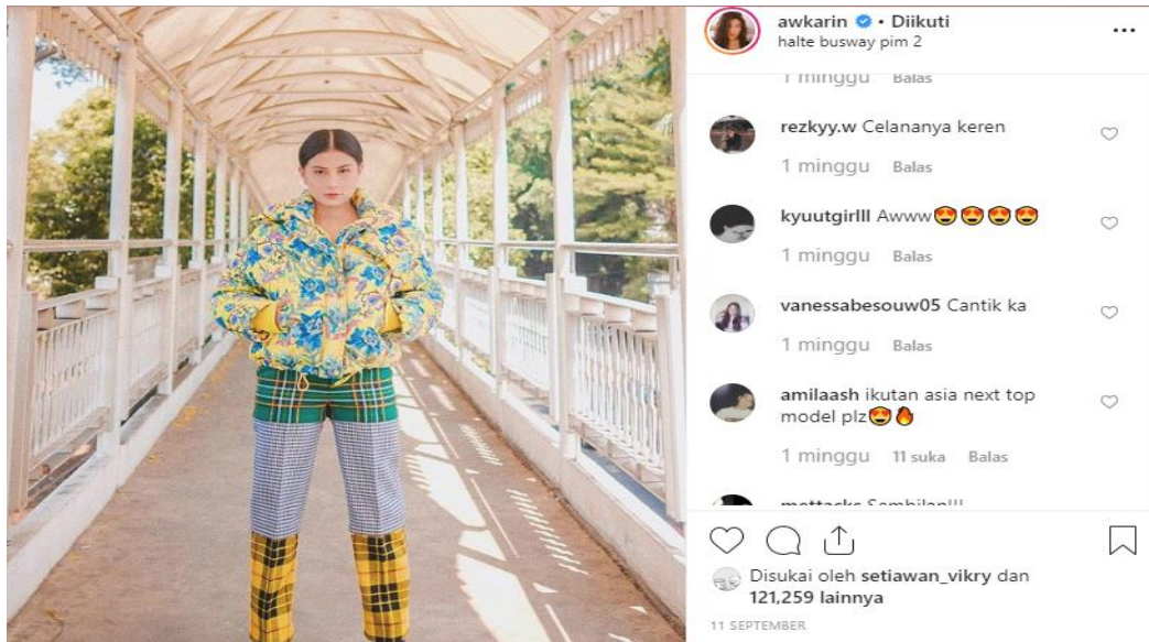
Figure 3 Fashion Awkarin