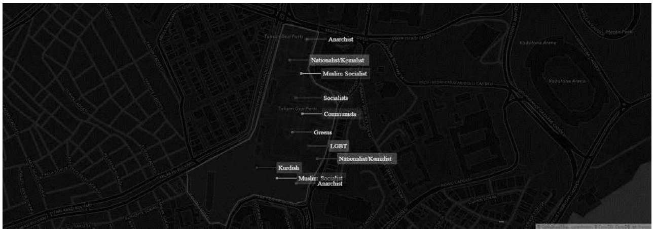
Figure 2, Occupation map of Gezi Park-Made by Authors, using @ OpenStreetMap contributors @ CartoDB

During the movement, the most marginalised groups of citizens were united in a peculiar way. 'The young hipsters' of Beyoglu were sharing the park with scarcely conciliable groups, such as the Anarchists and Islamist Socialists and LGBT community members. They organised their own 'streets' within the park, they shared the library, community garden, and kitchen, held voting polls for the management and cleaning of the site, secured the occupation camp (according to some interviewees the period of occupation of Gezi was the safest time and the park was the safest space that they experienced in Istanbul particularly since the police were not allowed into the site). The urban spaces and the moments produced by the 'others', represented and acknowledged their presence which, according to many, changed their perceptions about each other and created a dialogue between the different opposition groups and also between the homogenised society and the 'others' of the urban space.