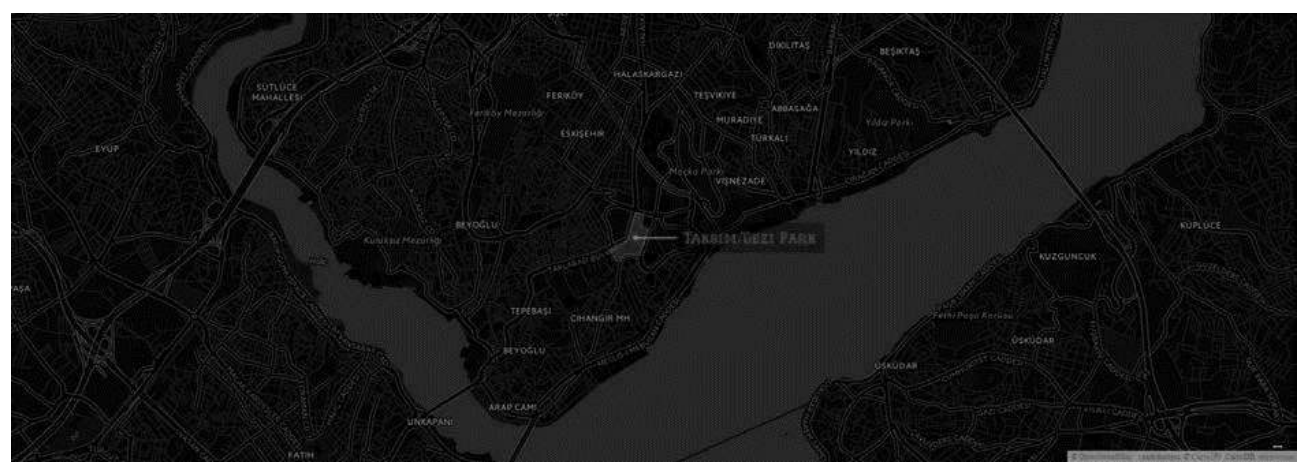
Figure 1, the location of Taksim Square and Gezi Park within the Central Istanbul – Made by Authors, using @ OpenStreetMap contributors @ CartoDB

Reflecting on the relationship between the differences in the unifying urban, Schmid (2012, p. 48) argue that: The specific quality of urban spaces arises from the simultaneous presences of very different worlds and value systems, of ethnic, cultural and social groups, activities and knowledge.