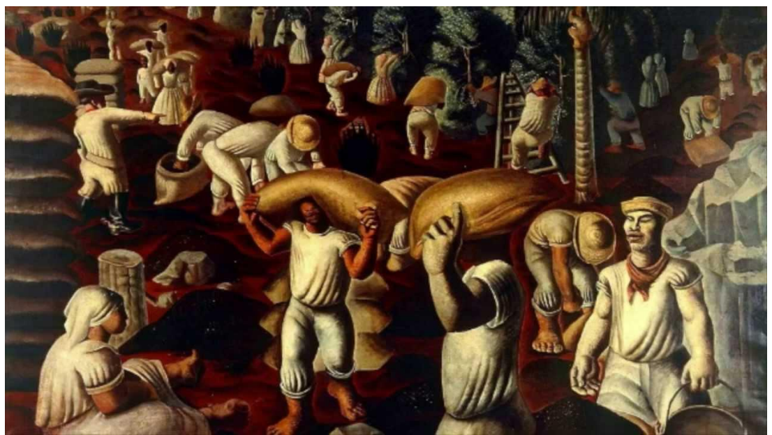
Figure 3: Café, Candido Portinari, 1935 (Museu Nacional de Belas Artes, Brazil)

They comprise childhood memories, very present in his artistic construction. The problem of man and reality are focal points in the Portinarian iconography. The landscape-scenario which hosts them is a redefinition of the space of a land lived, bound by lines and perspectives, characteristic of his memory of the trails in coffee plantations, in a hierarchy of planes and chromatic masses which reveal the cosmic force, the depth of the horizon, and the luminosity of the essence of life brought out by the theme of painting [14].