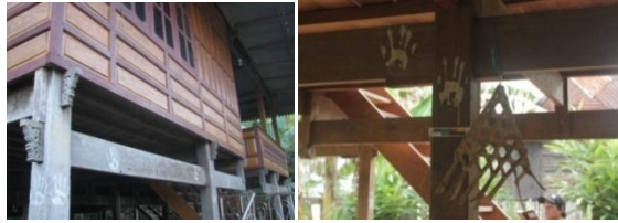
Hand prints on house posts in Barru District