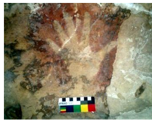
Photo 3. Hand prints on traditional house wall (left) and prehistoric cave hand stencils (right)

It can be concluded that hand stencil/print practices in South Sulawesi already existed back to the prehistoric era about 40,000 years ago. This practice is still present within the South Sulawesi area. It shows that stamping hand print is very important that it is keep practiced for thousands of year. By drawing analogy with the mabedda bola tradition, conclusion could be drawn that the cave hand stencils in South Sulawesi might have the similar function and meaning as disaster repellent.