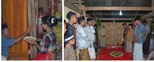
Applying hand print (left) and situation during mabedda bola ceremony (right).