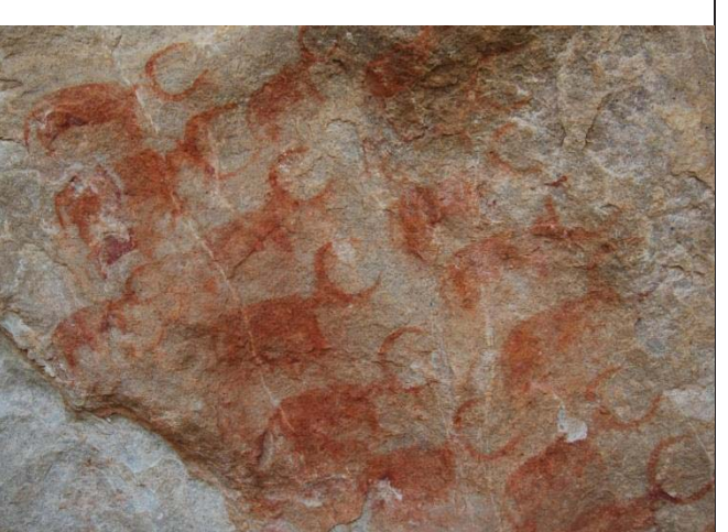
6. Hesmele: Painting at rockshelter-2(Cave)