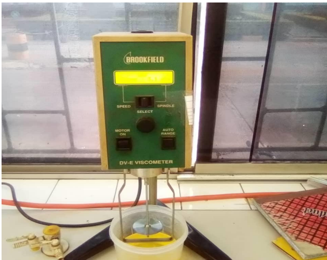
Figure 1: The DV-E Brookfield viscometer used for experimental measurement of oils viscosities.