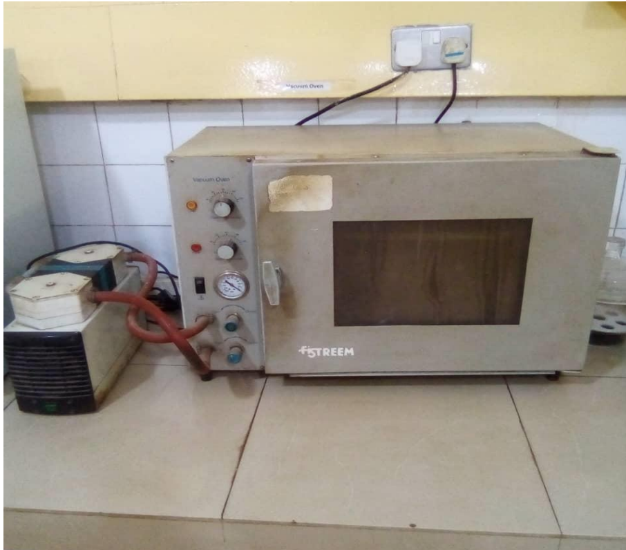
Figure 4: The F-STREEM Vacuum Oven for demoiaturizing water from the oil samples during the determination of moisture content

The crucible was then filled with 2 ml of the oil and the above procedures was repeated and recorded in Table 1.