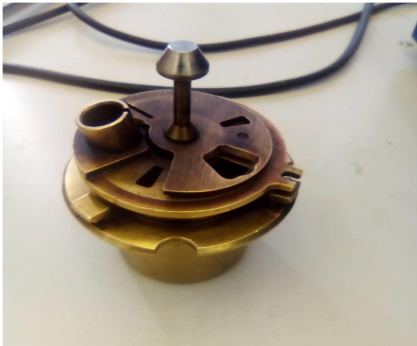
Figure 3: The flash point cup inside the PM-4 Petrotest flash point machine used for housing the spinning fluid