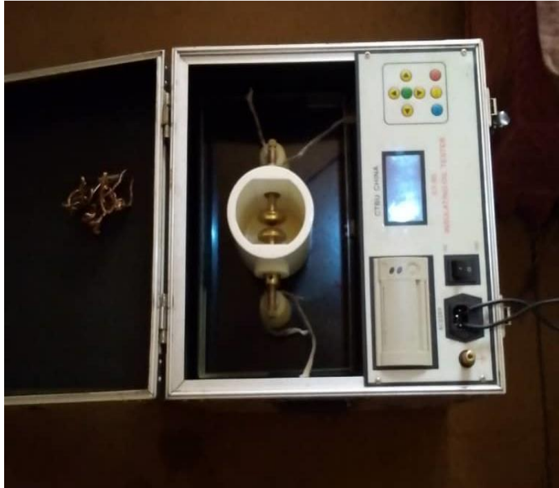
Figure 6: The MEGGER 60 KV Oil Tester Machine used for measuring transformer oil dielectric constant