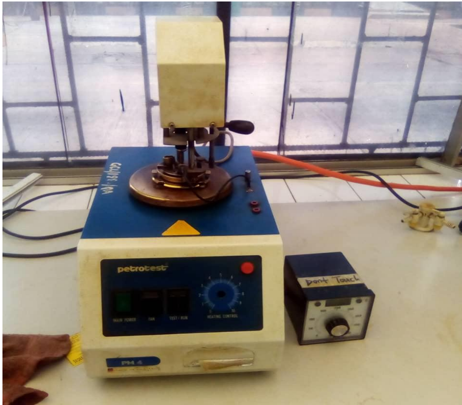
Figure 2: Experimental setup for flash point measurement using the PM-4 Petrotest flash point machine

outlet of the flash cup at an interval of 2 to 3 minutes until the light goes out (flashed). The temperature at which the oil sample flashed was noted immediately on the thermometer and recorded in Table 1.