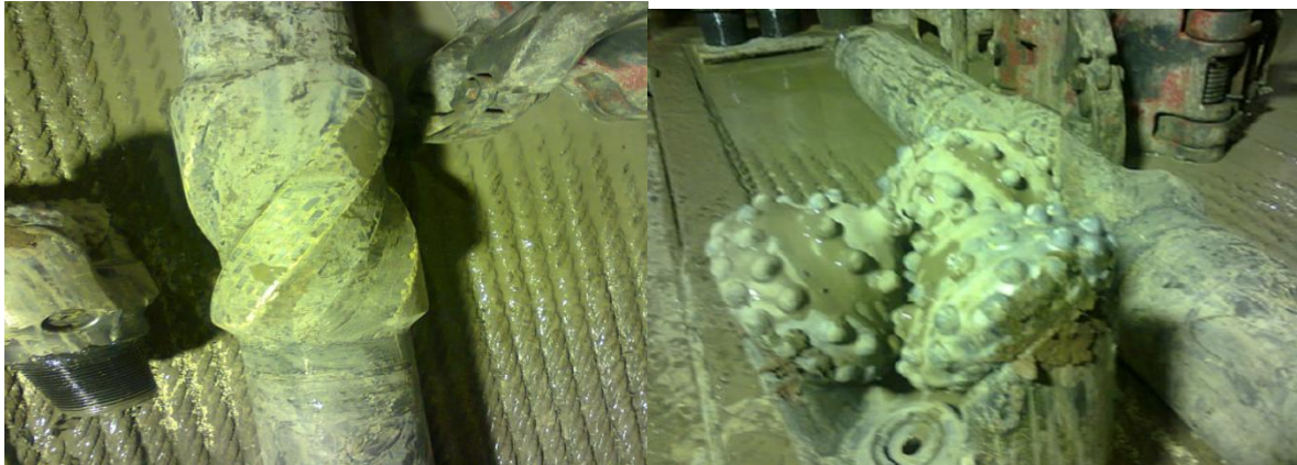
Figure (1) pictures show no bit balling or stab's balling resulting no drag on trips

Pressure Drilling & Underbalanced Operations Conference & Exhibition, 24-25 February 2010, Kuala Lumpur, Malaysia