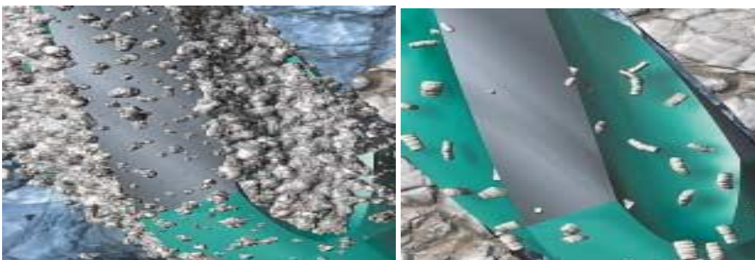
inhibition action #3: Superior Clay inhibition