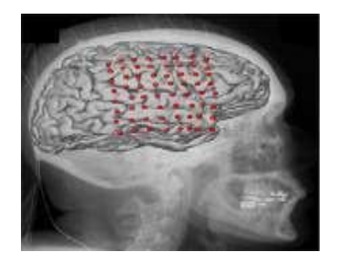
Fig 1: Artist's view of Electrode Implants.