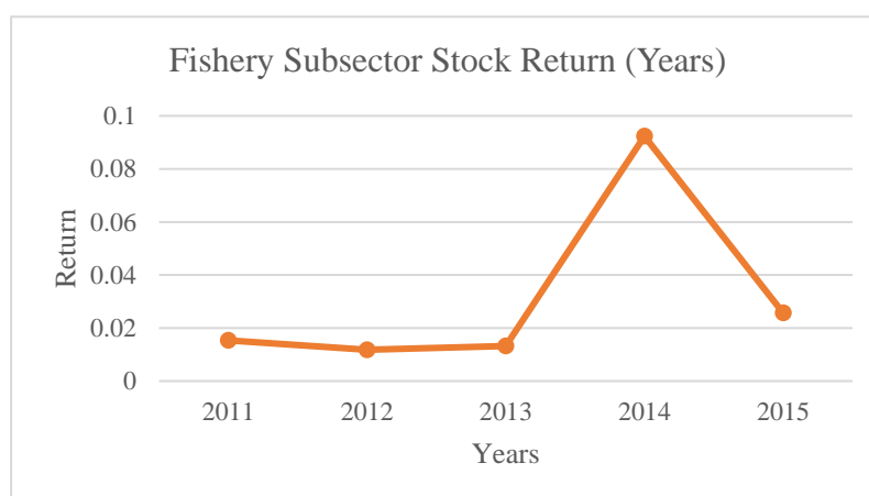
Figure 1 Fishery subsector stock return

The entire manuscript, including mathematical equations, tables, and figures Indonesian stock market showing its growth by the end of 2015. According to Financial Services Authority (FSA) there is an improvement in terms of number of transaction, number of listed companies, and Indonesia Composite Index. This growth can be used as an oportunity for a new investor to invest in Indoseian stock market. One of the sector that supposed to be the superior in Indonesian stock market is fishery sector, as a maritime country, Indonesia has a lot advantages in fishery sector. However the fishery sector showing a significant stock price reduction. This reduction is followed by stock return reduction. Stock return is one of the most important consideration factor for investor. The stock return reduction on fishery subsector can be seen on figure 1.