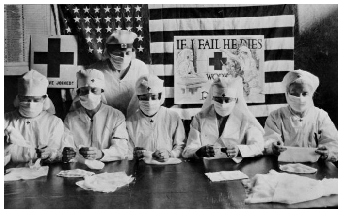
Figure 1: American Red Cross workers make face masks during the 1918 Spanish Flu pandemic [48]