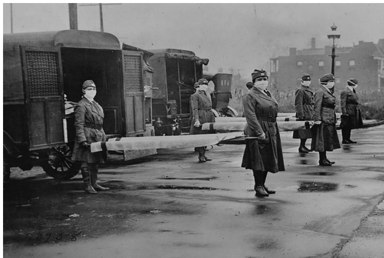
Figure 3: Mask-wearing women hold stretchers near ambulances in the USA in 1918 [50]