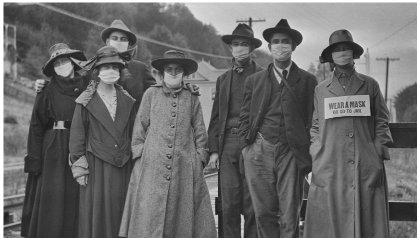
Figure 6: Face masks are an ordinary sight in 1918 [53]