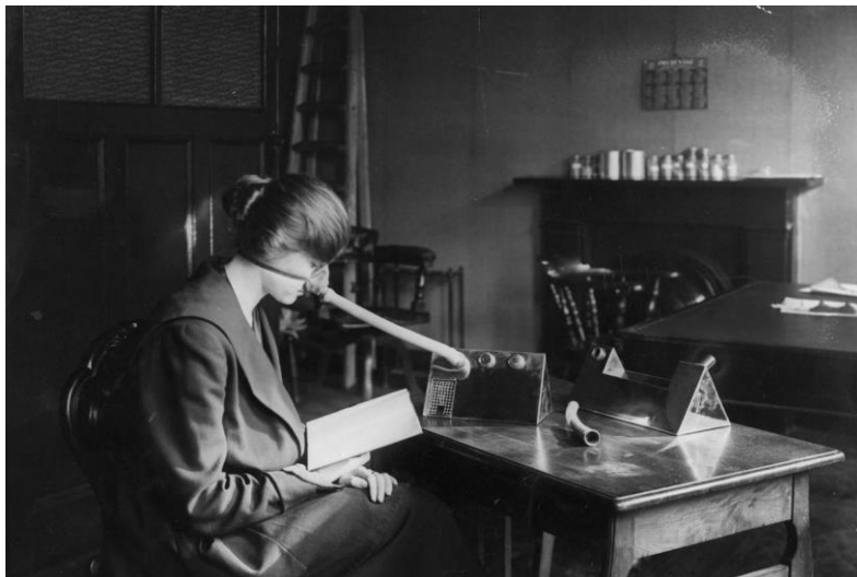
Figure 4: A woman wearing a flu mask during a pandemic [51]