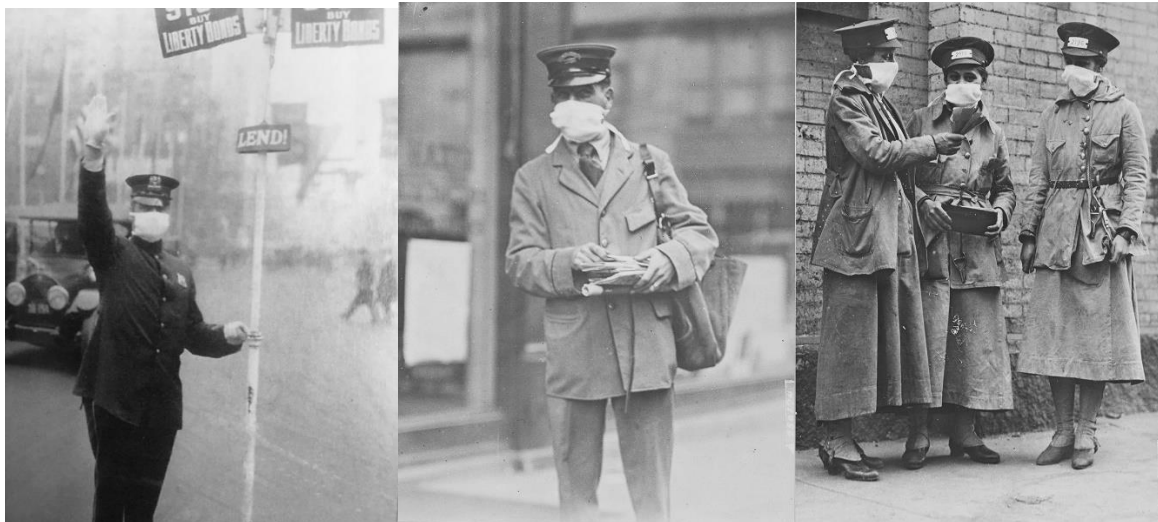
Figure 5: New York City in 1918 [52]