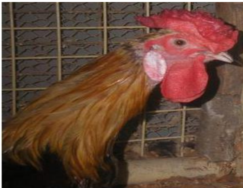
Plate 1: Gallus gallus domesticus