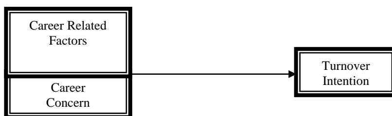
Figure 1: Proposed model of the Study

Hypothesis2: Career concern is positively related with turnover intention.