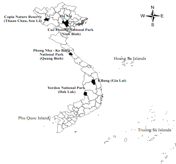
Figure 1: Location of sampling the eight Dalbergia species in the Vietnam. D. assamica collected from Ha Noi and Cuc Phuong National Park (Ninh Binh); D. conchinchinensis collected from Yordon National Park (Dak Lak) and KBang (Gia Lai); D. nigrescens collected from Copia Nature Reserve, (Son La) and Yordon National Park (Dak Lak); D. oliveri collected from Yordon National Park (Dak Lak); D. tonkinensis collected from Hanoi suburbs and Phong Nha - Ke Bang National Park (Quang Binh); D. hancei , D. dialoides and D. entadioides collected from Phong Nha - Ke Bang National Park (Quang Binh).