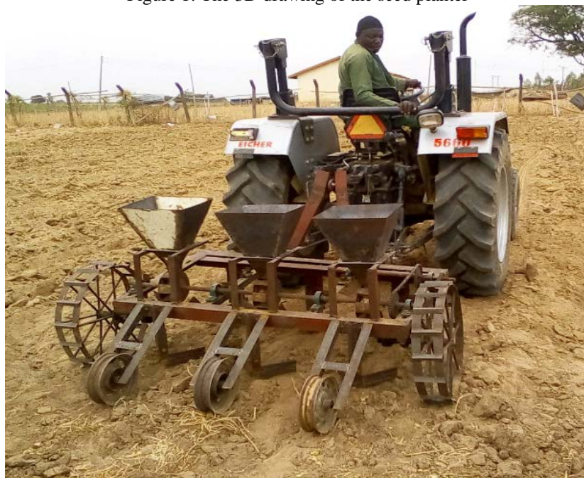
Plate 1: The fabricated seed planter