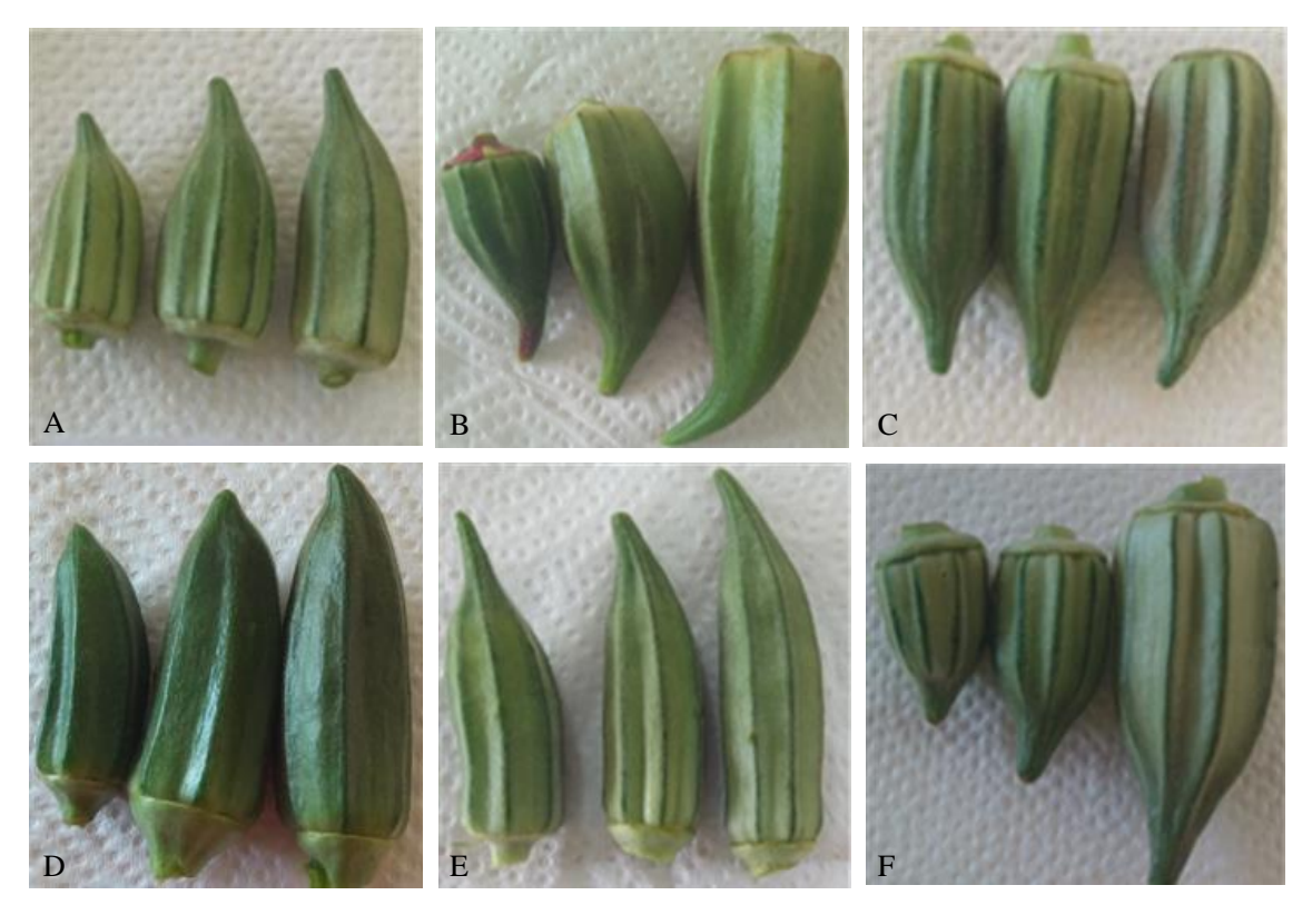
Figure 1: Varieties of Okra studied: A) F1 Yodana; B) Local; C) Kirikou; D) Kousko; E) Volta; F) Yeleen

The biological material used in this study consisted of six varieties of okra, namely F1 Yodana, Kirikou, Volta, Yeleen, Kousko and Local (Fig. 1). The samples of okra were collected in the region of Daloa (Côte d'Ivoire). They were fresh and without infections or wounds.