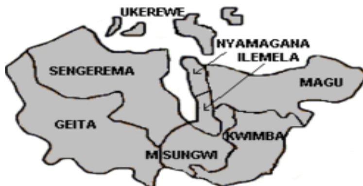
Figure 1. Mwanza regional map

The study was conducted in Mwanza, one of Tanzania's 31 administrative regions. The region has 8 districts namely: Nyamagane, Ilemela, Magu, Kwimba, Misungwi, Geita, Sengerema, and Ukerewe, with a total population of about 3,125,995 and, it is the second largest region after Daressalaam (Ngogwe and Kongolo, 2020) (Figure 1).