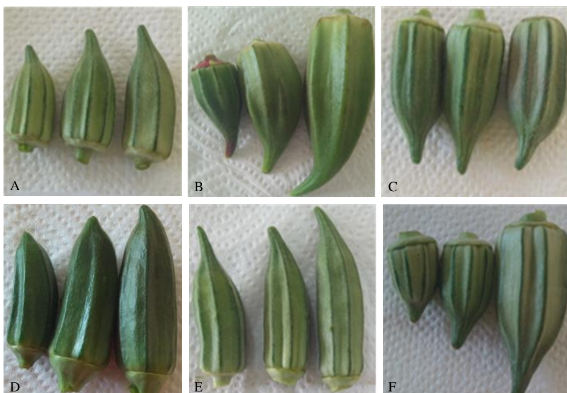
Figure 1: Varieties of Okra studied: A) F1 Yodana; B) Local; C) Kirikou; D) Kousko; E) Volta; F) Yeleen

The biological material used in this study consisted of six varieties of okra, namely F1 Yodana, Kirikou, Volta, Yeleen, Kousko and Local (Fig. 1). The samples of okra were collected in the region of Daloa (Côte d'Ivoire). They were fresh and without infections or wounds.