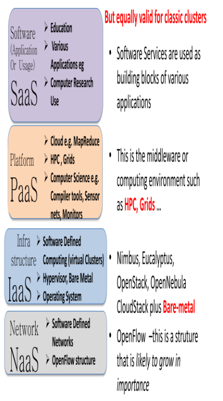
Figure 5: Various Cloud Models