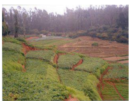
Fig. 4. Bench terracing