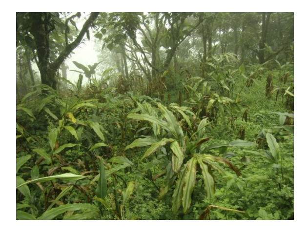
Fig. 12: Cultivation of large cardamom with Alnus nepalensis help to improve soil fertility (Phalut, Darjeeling(7000 m asl))