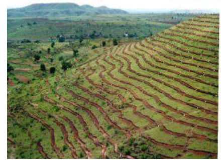
Fig. 3. Contour trenches