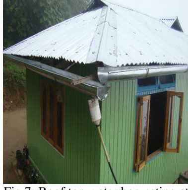
Fig.7: Roof top water harvesting at Lava (2000 m asl)