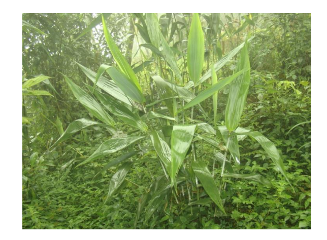
Fig. 13: Broom grass cultivation under terraced land of Darjeeling hill (Lava, Maypate village)