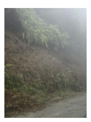
Fig. 11: Soil and water conservation through fern