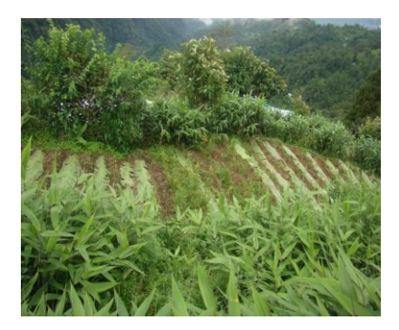
Fig. 2: Mulch farming practice for cultivation of Ginger.

Mulch farming is a system of maintaining a protective cover of vegetative residues such as straw, maize stalks, fern fronds and stubbles (wheat and rice) on the soil surface at all times. The system is particularly valuable where a satisfactory plant cover cannot be established at the time of year when erosion risk is greatest. The beneficial effects of mulching include protection of the soil surface against raindrop impact, decrease in flow velocity by imparting roughness, and improved infiltration capacity (Mukherjee, 2010). It also enhances burrowing activity of some species of earthworms (e.g. Hyperiodrilus and Eudrilus spp.) which improves transmission of water through the soil profile and reduces surface crusting and runoff and improves soil moisture storage in the root zone.