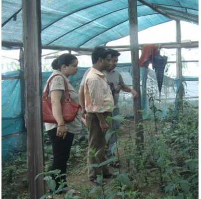
Fig. 8 : Conservation of endangered medicinal plant at an altitude of 2000 m asl (lava) under RRS, UBKV.