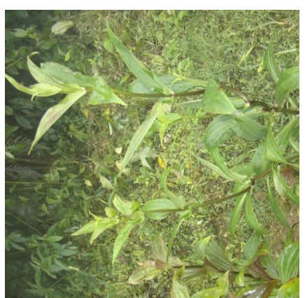
Fig. 10: Conservation of Swertia chirayita (Sherpa Gao, Lava)