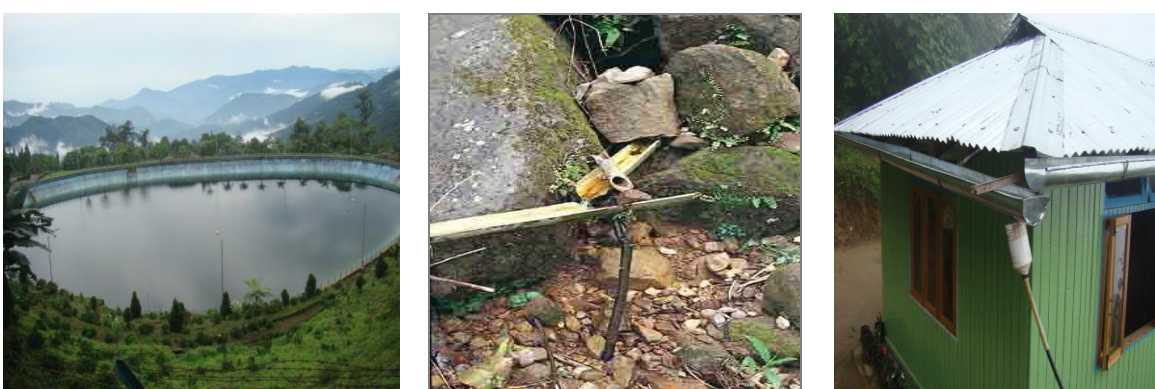
Fig.5 : Water harvesting through interrelated channel pipe rain water (Alagariah, 1600 m asl)