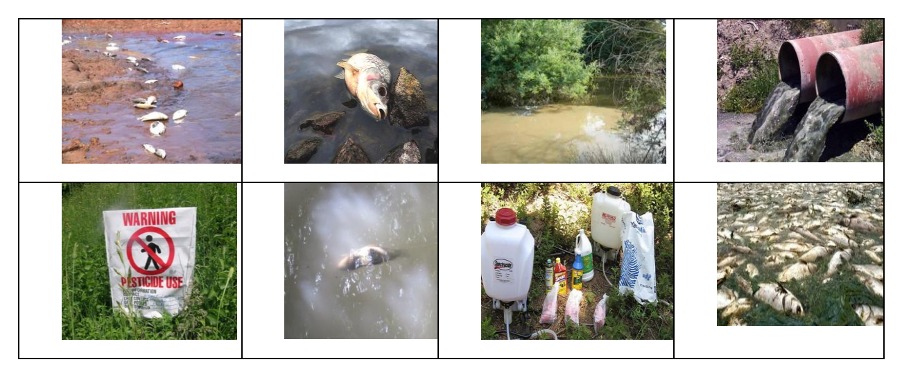
Figure 1: The following figures show the exposure of fish to the environmental pollutants in clouding pesticides.